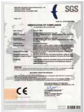
CE MD Certificate