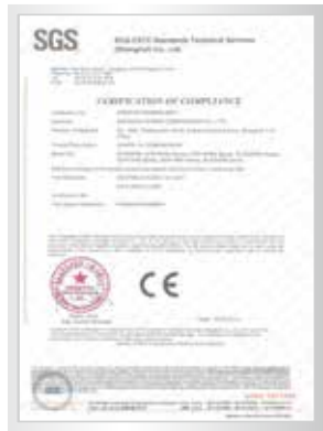
CE EMC Certificate