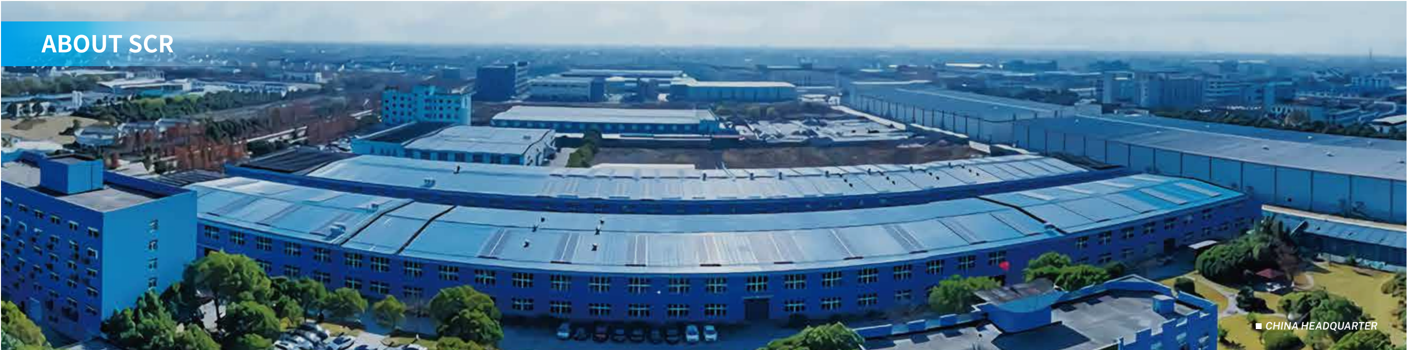
■ CHINA HEADQUARTER

SHANGHAI SCREW COMPRESSOR CO.,LTD is a high tech Japanese joint venture with independent intellectual property, founded in 2000. SCR together with Anest Iwata focus on air compressor research and development, covering all aspects from manufacturing through to sales, service and technical support. SCR supply a complete range of products such as high efficiency permanent magnet variable speed air compressors, oil free screw compressors, oil free scroll compressors, bearing free and magnetic centrifugal blowers. The global sales and service network provide our customers with high-quality, energy efficient and environmentally friendly compressed air solutions. SCR's statement of "Inspire Infinite Power" signifies the close relationship with their global partners, and suppliers. SCR is committed to building an industrial world with continuous improvement for both its customers, the environment and its employees.