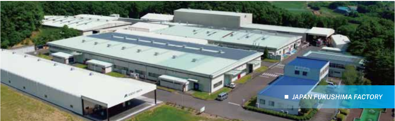
■ JAPAN FUKUSHIMA FACTORY