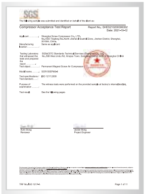
SGS Performance Certificate