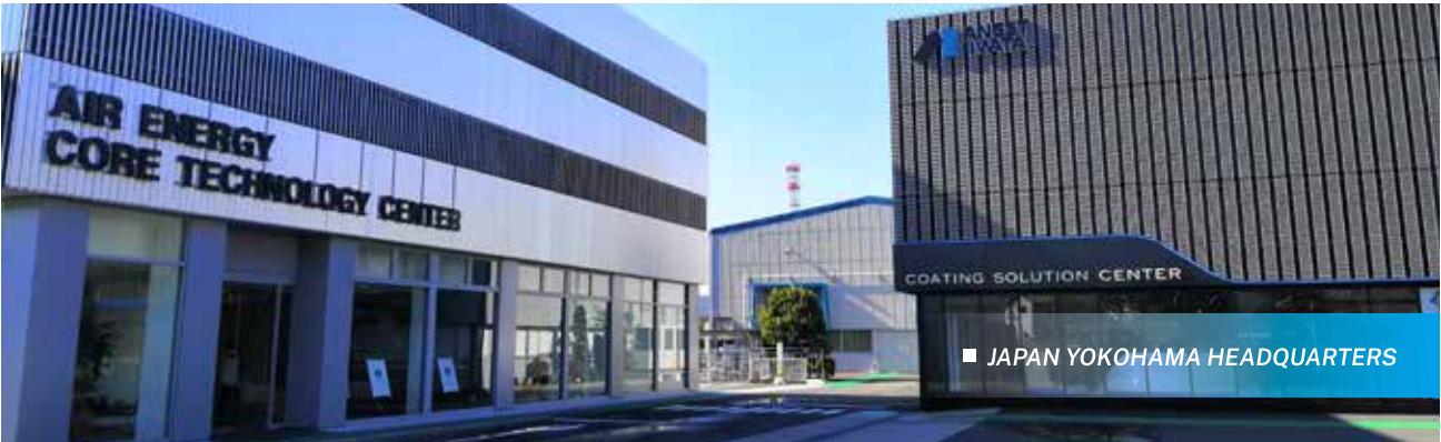
■ JAPAN YOKOHAMA HEADQUARTERS

SHANGHAI SCREW COMPRESSOR CO.,LTD is a high tech Japanese joint venture with independent intellectual property, founded in 2000. SCR together with Anest Iwata focus on air compressor research and development, covering all aspects from manufacturing through to sales, service and technical support. SCR supply a complete range of products such as high efficiency permanent magnet variable speed air compressors, oil free screw compressors, oil free scroll compressors, bearing free and magnetic centrifugal blowers. The global sales and service network provide our customers with high-quality, energy efficient and environmentally friendly compressed air solutions. SCR's statement of "Inspire Infinite Power" signifies the close relationship with their global partners, and suppliers. SCR is committed to building an industrial world with continuous improvement for both its customers, the environment and its employees.