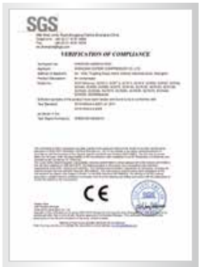
CE EMC Certificate