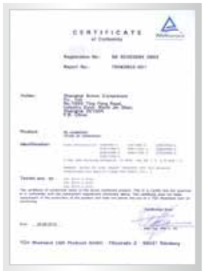
CLASS 0 Certificate