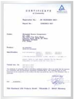
CLASS 0 Certificate