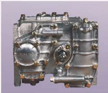
■ Gear Pump Type