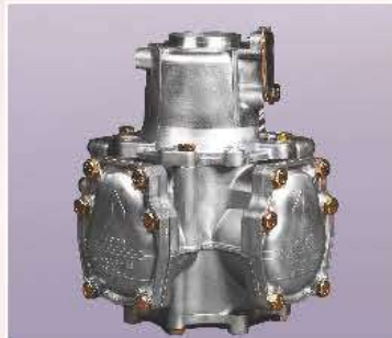
■ 4-Piston flow meter